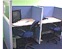
Your Work Area